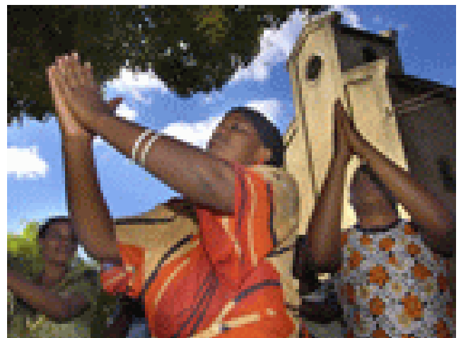
Members of the Moravian Church choir in Tabora, Tanzania rehearse in the courtyard.

Editor’s Note: Video segments about the Tanzanian mission and the Moravians still may be viewed at mcall.com/africa .