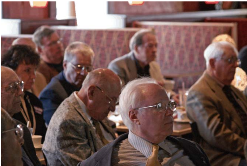
Club members viewing presentation at the Allentown Brew Works.