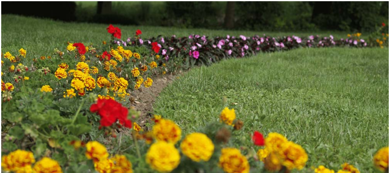
Late summer bedding plants at the Allentown Rose Garden on a beautiful Friday afternoon after Rotary.