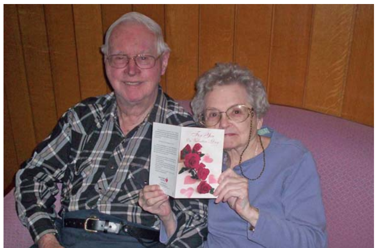
Episcopal House recipients of Rotary Valentine!