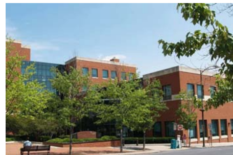
Lehigh County Government Center.

Regionalization and its advantages was another topic of Cunningham’s talk. He used the water pact between Allentown and the Lehigh County Authority as one of many examples of his administration’s commitment to and success in regionalization efforts.